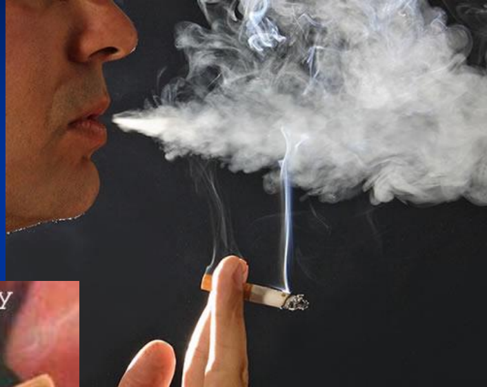
The Anti-Smoke Ashtray